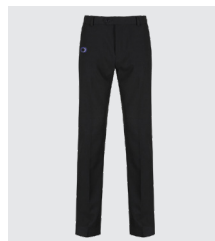
Trousers or Skirt