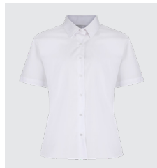
Twin Pack Shirt or Blouses